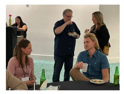
A casual networking reception at the December workshops allowed attendees to meet to discuss the practice of clinical hypnosis and share tips and best practices.

On December 2–5, 2021, 65 faculty members and participants met near Orlando, Florida for Level 1, Level 2, and Advanced Workshops. The program was the first time faculty and workshop attendees were able to meet face-to-face since 2019.